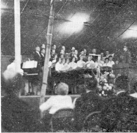
Combined Chicago-La Grange Chorale singing praises to God under The Big Tent.